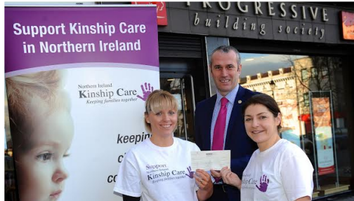
Presentation of Community Award and a cheque for £1,000 from the Progressive Building Society.

Kinship Carers struggle to meet the everyday costs of raising a child.